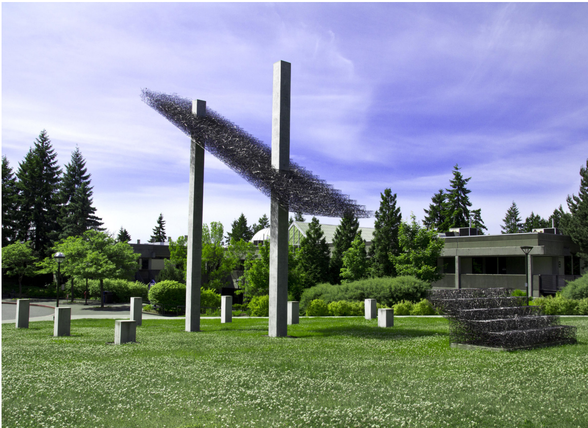
Endless by Lead Pencil Studios is located at Bellevue College and owned ArtsWA.